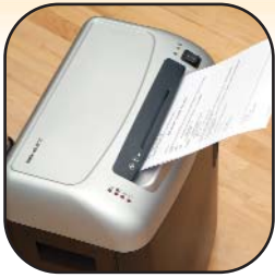
Ergonomic angled throat makes shredding easier