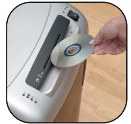
Safely shreds CD's