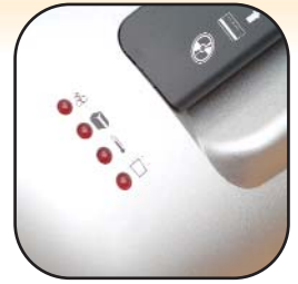
Warning indicators for thermal overload, jamming, bin full & safety switch activation, increase ease of use