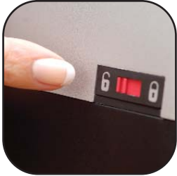
Safety-lock switch disables shredder preventing accidental activation