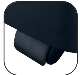
Castors increase mobility