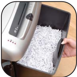
Easy to empty cabinet style bin with pull out waste basket