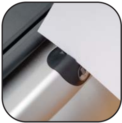
Sheet capacity gauge helps prevent jams